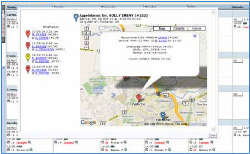
Figure 3: Client Appointment Details